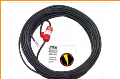
PR-XX (light preformed loop with lighting protection)

The ULTRAMETER™ display makes installation, set-up and troubleshooting easy. Each time a vehicle is moved onto the loop, the display indicates the sensitivity necessary to detect vehicle. Simply set the sensitivity to the value displayed to detect the vehicle. Interference or crosstalk from adjacent loops or other sources are displayed as a constantly varying number on the ULTRAMETER™. This condition may be avoided by maintaining a minimum of 5 kHz separation in multi-loop applications.